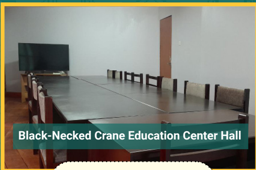
Black-Necked Crane Education Center Hall