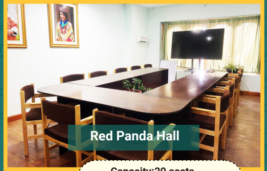
Red Panda Hall