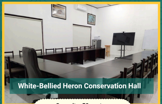
White-Bellied Heron Conservation Hall