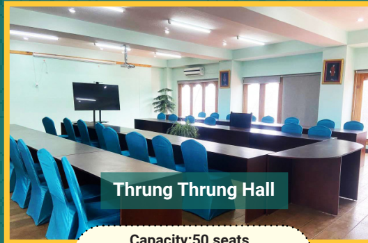
Thrung Thrung Hall